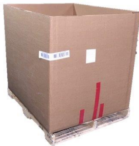
Triple and Double Wall Gaylord 47"L x 39"W x 43"H Squared Corners