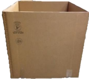
Used Plain Triple Wall Gaylord 41"L x 36"W x 34"H Triple Wall - Square Corners