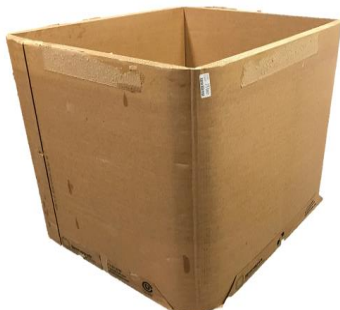
Reclaimed Double Wall Gaylord 47"L x 40.5"W x 40.5"H Double Wall - Octagonal