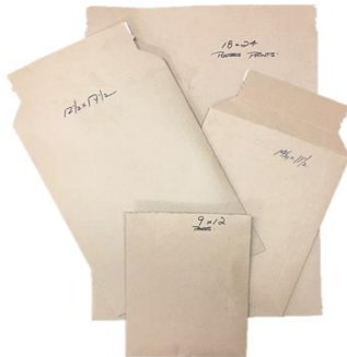
Kraft Paperboard Self Seal Mailers