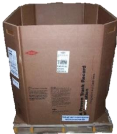
Used Quad Wall Gaylord 45"L x 37"W x 40"H Quad Wall - Octagonal