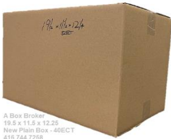
New Recycled Box - 40ECT 19.5\"/>

19.5 11.5 12.5 40 ECT New Plain 1.6 Specials