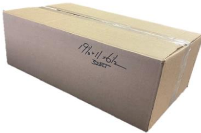
Recycled Plain Box - 32ECT 19.5\"/>

19.5 11.5 12.5 40 ECT New Plain 1.6 Specials